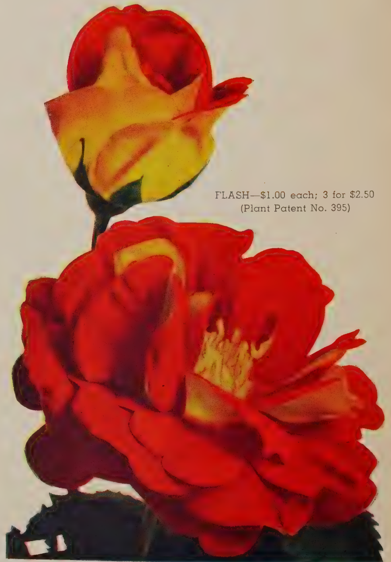
FLASH—$1.00 each; 3 for $2.50 (Plant Patent No. 395)

CLI. HOOSIER BEAUTY —Everblooming double flowers of dark velvety red. Long slender buds. 85c each, 3 for $2.40.